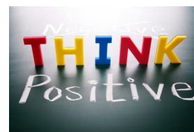
A positive attitude.