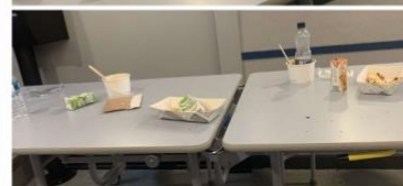
What we do want to see...